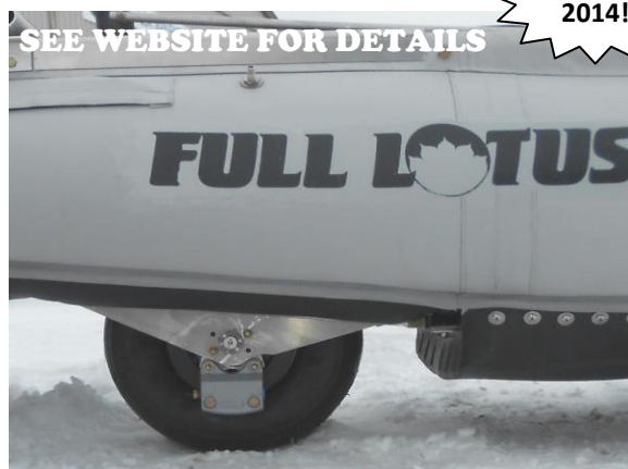
GREAT NEW AMPHIBIOUS FLOATS!