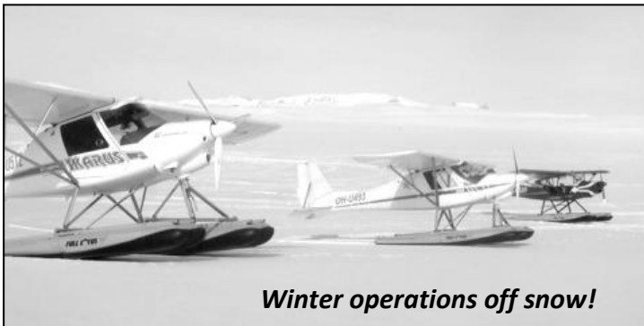
Winter operations off snow!

FULL LOTUS floats can also be used as skis , and in many ways, are better than traditional aircraft skis: You can land in very soft snow without sinking-in due to the large footprint of the floats; Winter fliers no longer needs to worry about landing on thin ice or frozen rivers: A Full-Lotus equipped aircraft will float where a ski plane would break through and sink.